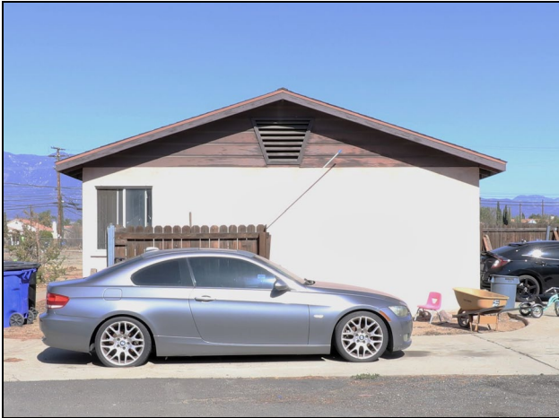
South elevation, view north (10/28/22).

Page 3 of 6 *Resource Name or #: (Assigned by recorder) 8531 Almond Avenue *Recorded by LSA Associates, Inc. *Date: November 2022 Continuation Update