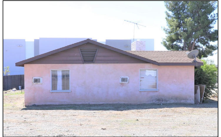
North elevation, view south (10/28/22).