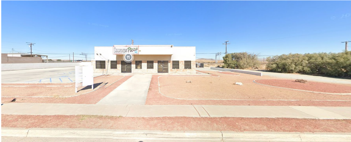
Looking north at the subject property from Main Street