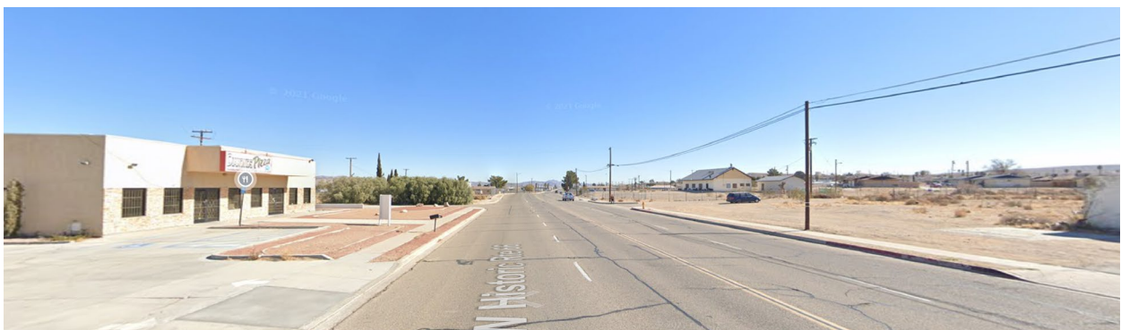
Looking east at the subject property from Main Street