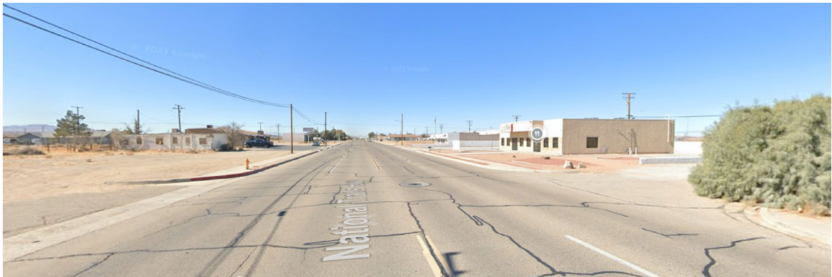
Looking west at the subject property from Main Street