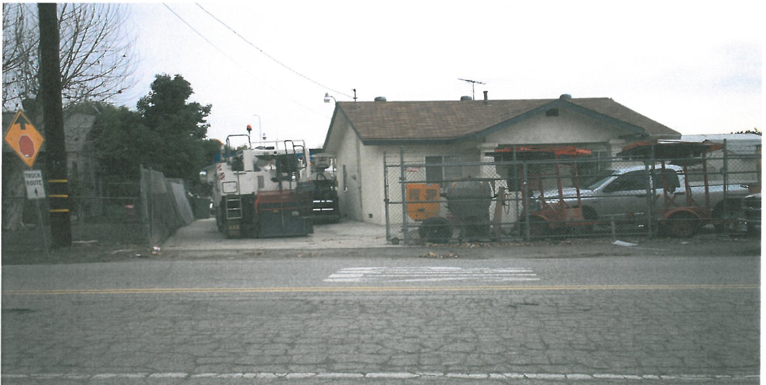
2. View of existing entrance along the northerly boundary of the project site.