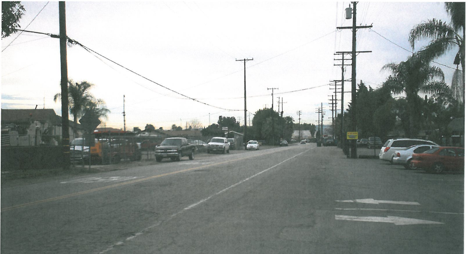
4. View of the project site frontage on the left and the typical streetscape on the opposite side.