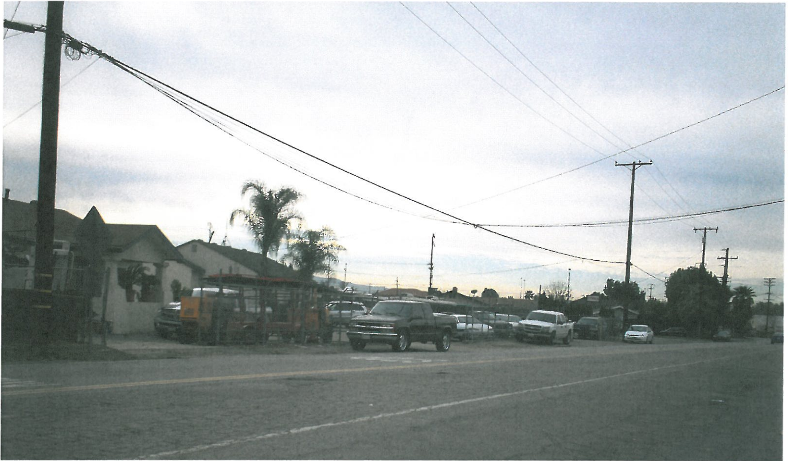
1.) View of project site frontage and structure requiring a variance