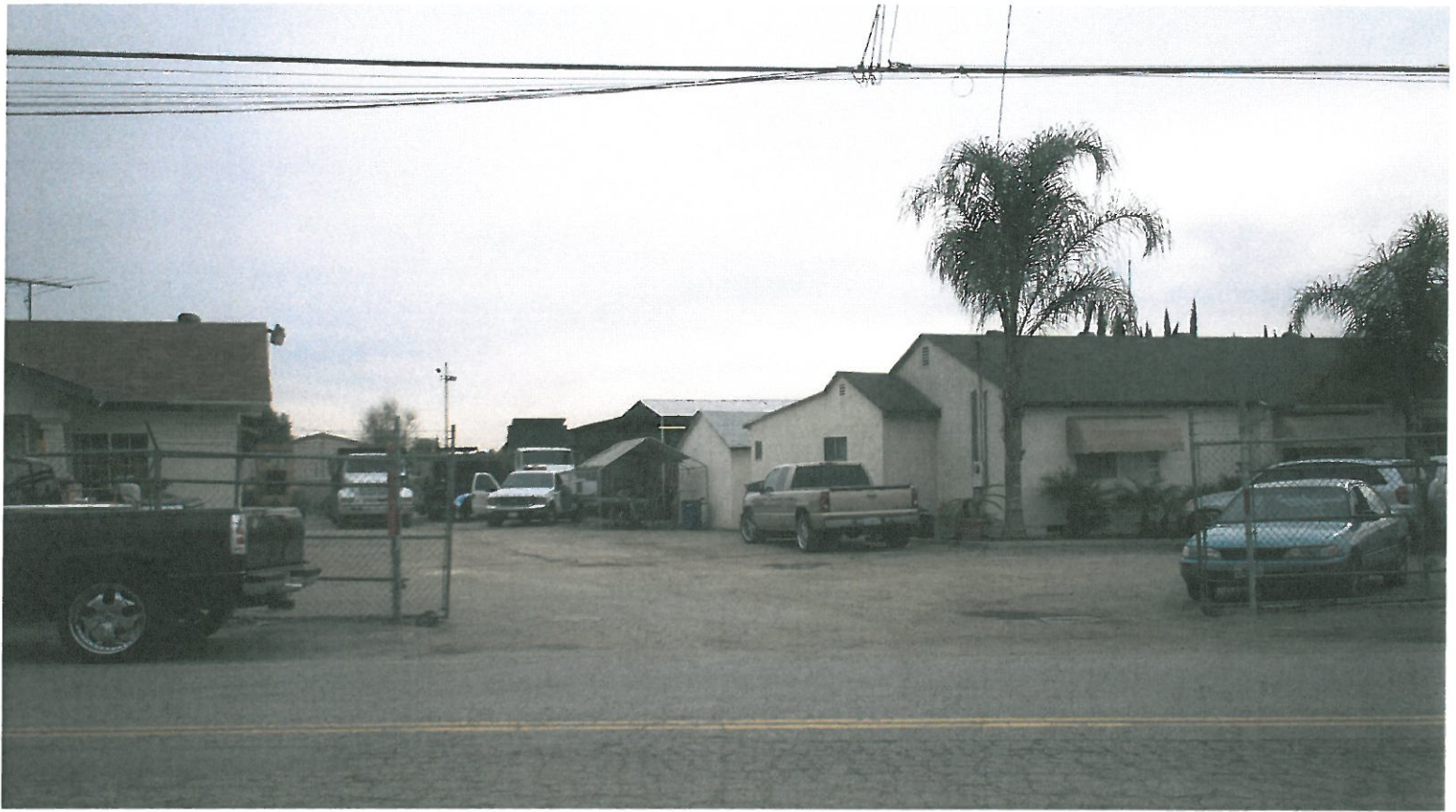
3. View of the project site along the southerly boundary and the adjoining south project site.