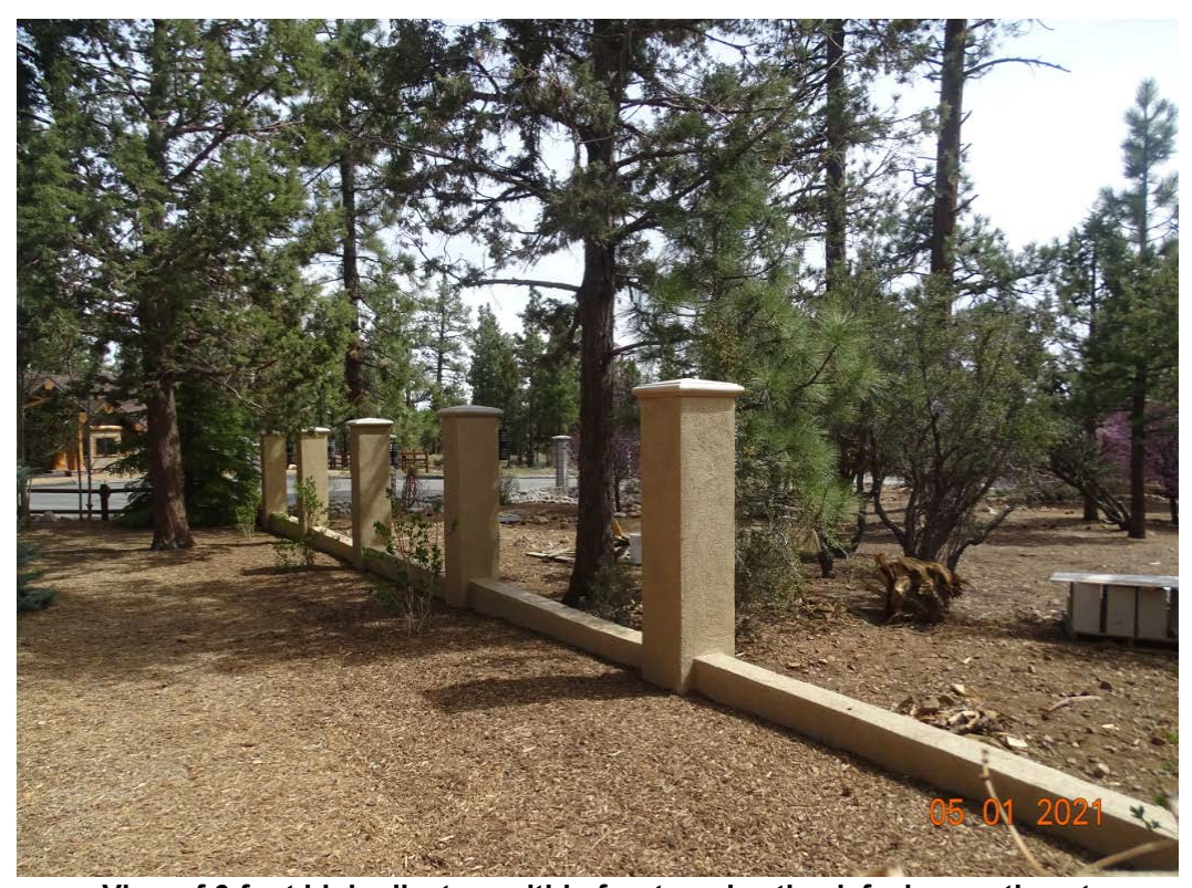
View of 6-foot high pilasters within front yard setback facing northeast