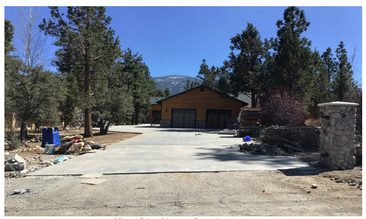
View of the driveway from the street.