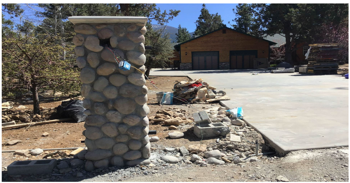
View of the 6-foot high block pilaster within front yard setback.