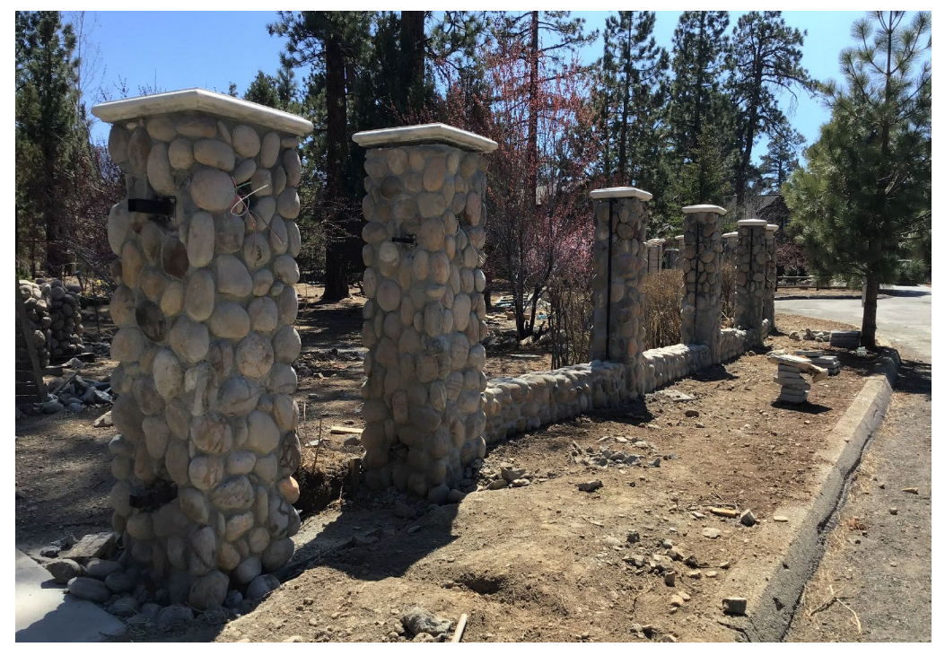
View of 6-foot high pilasters within front yard setback facing southwest]