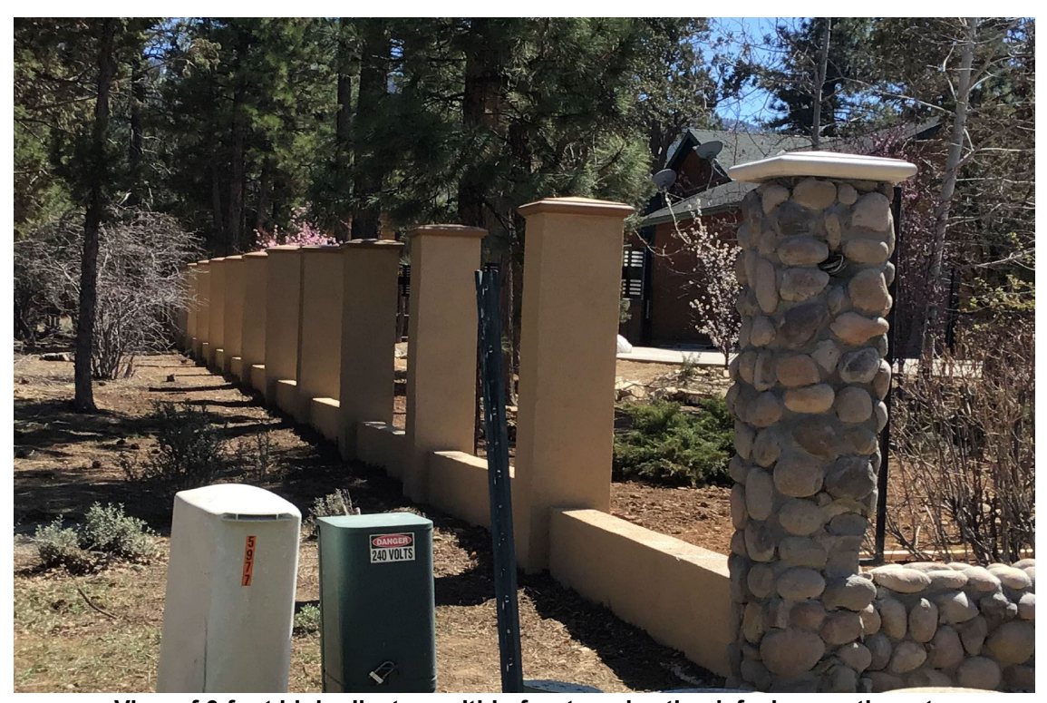
View of 6-foot high pilasters within front yard setback facing southwest