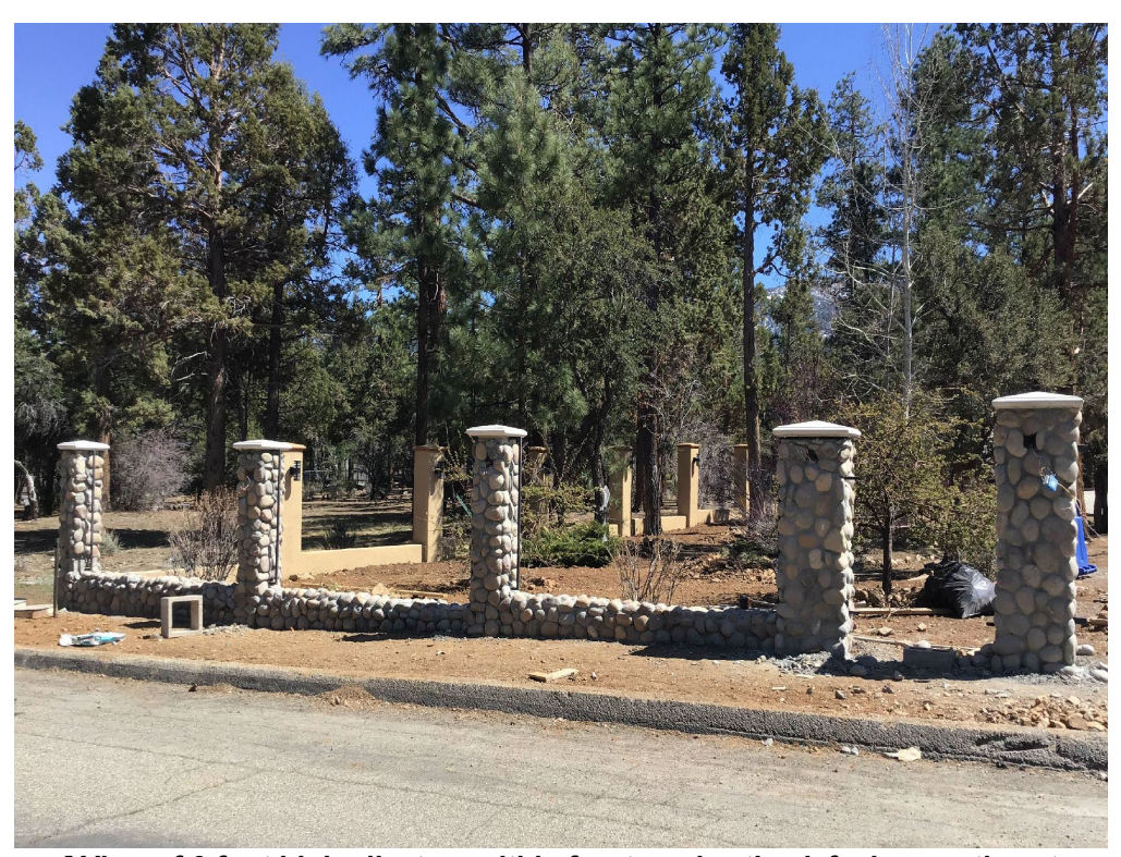
[ View of 6-foot high pilasters within front yard setback facing southeast