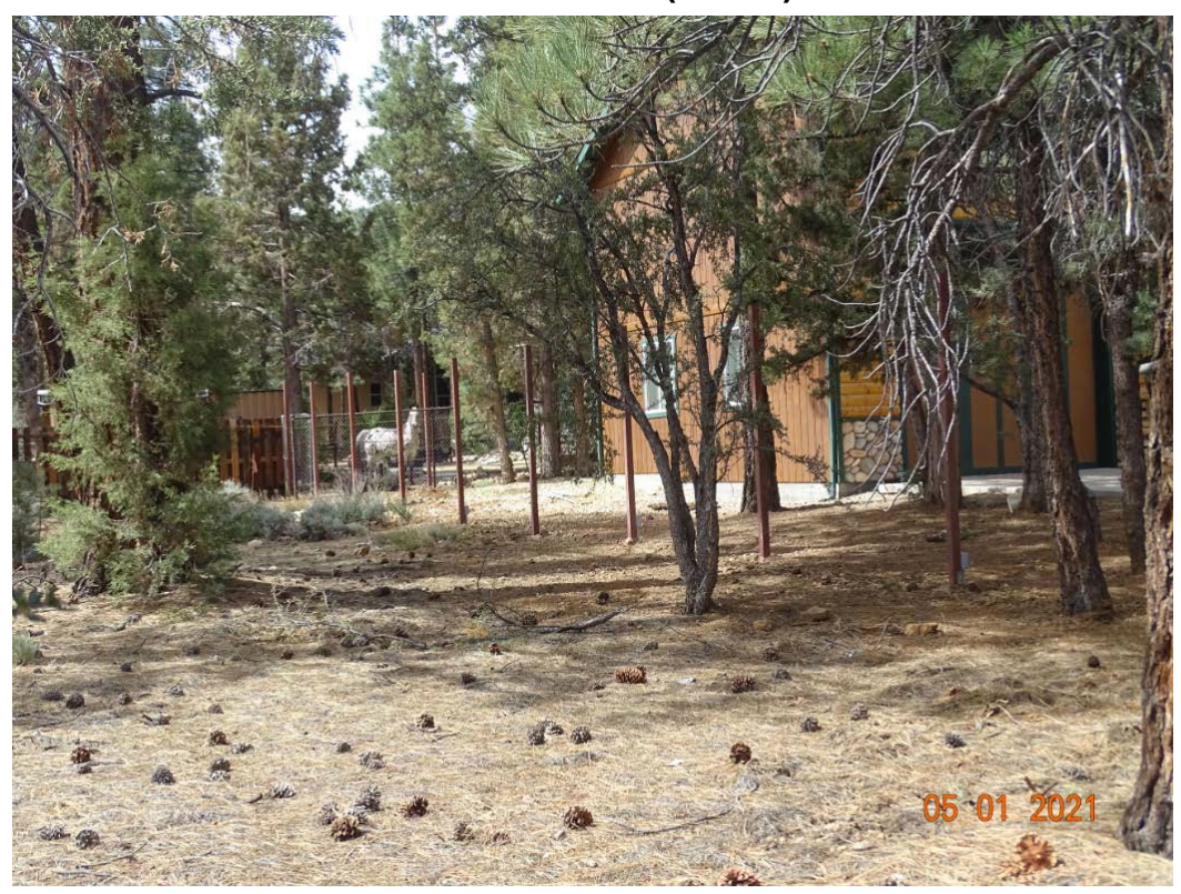
View of neighbor fence facing towards southwest