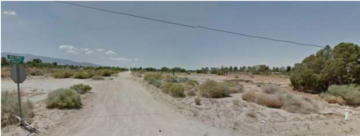
View Looking West at Yucca Terrace Road