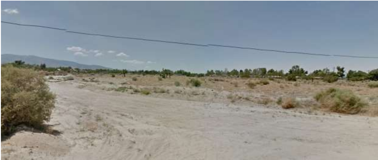
View Looking West into Site