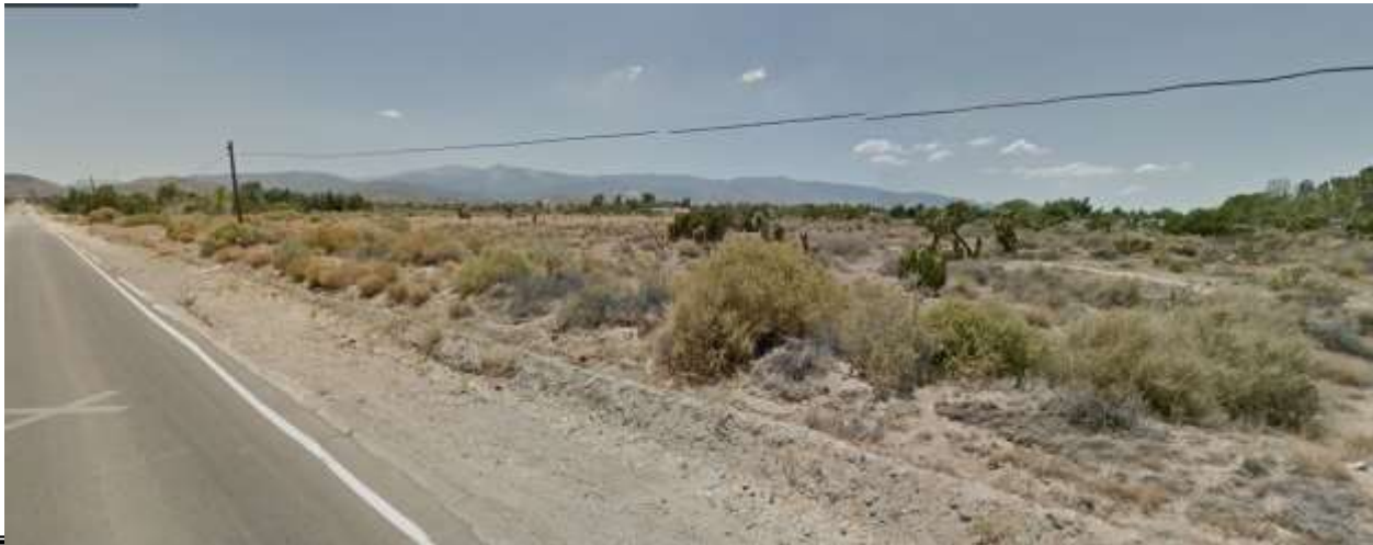
View looking South on Johnson Road