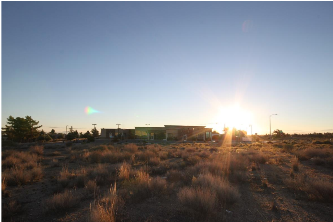
Looking east along Sierra Vista Road from the middle of the project site.