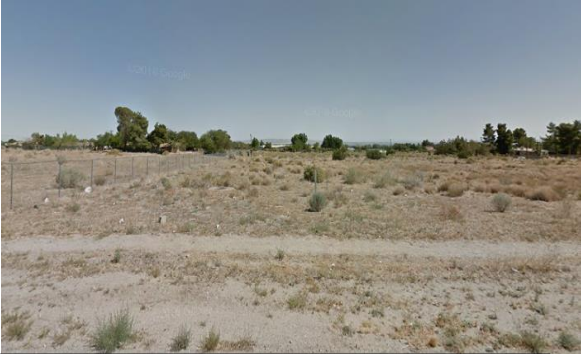
Looking north from Phelan Road onto the property west of the Project site.