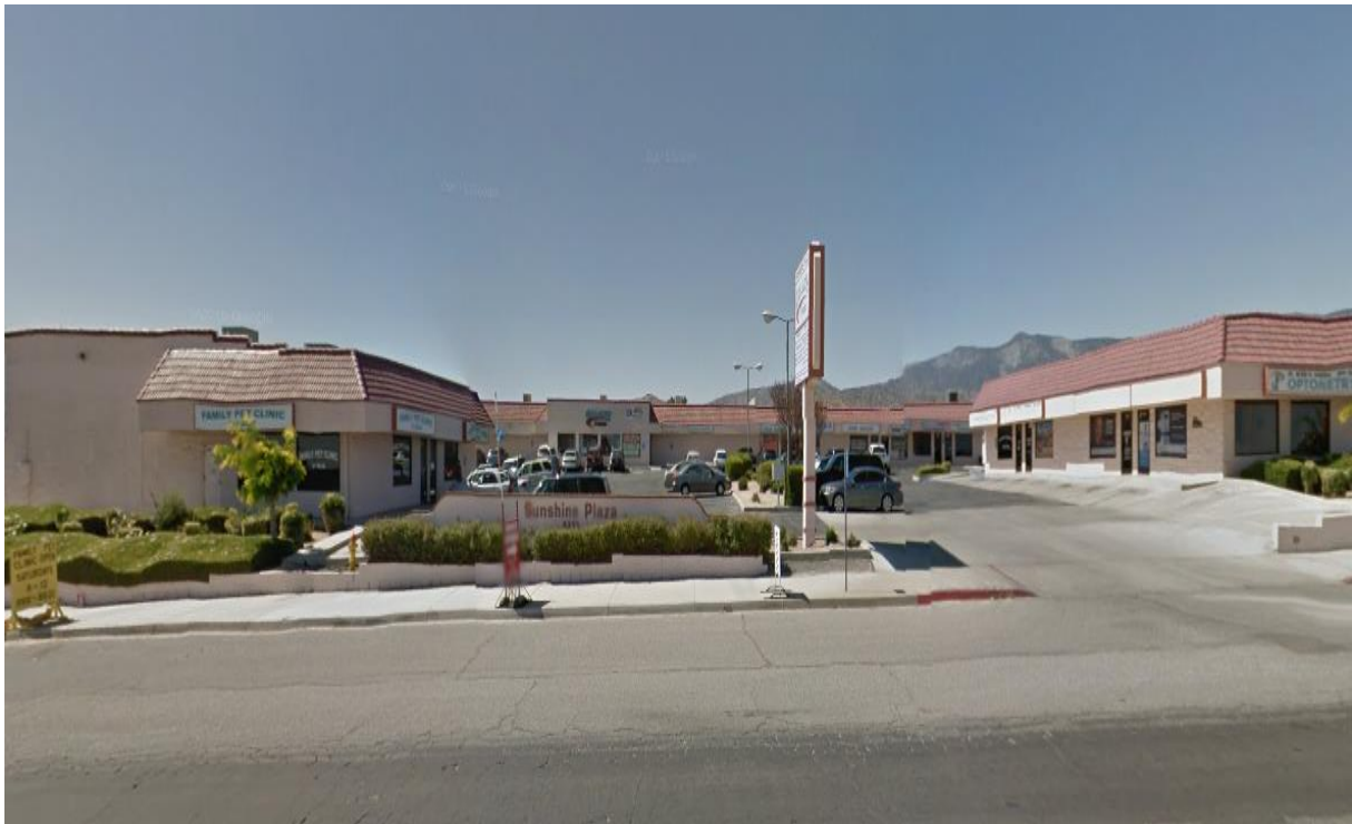
Looking south along Phelan Road.