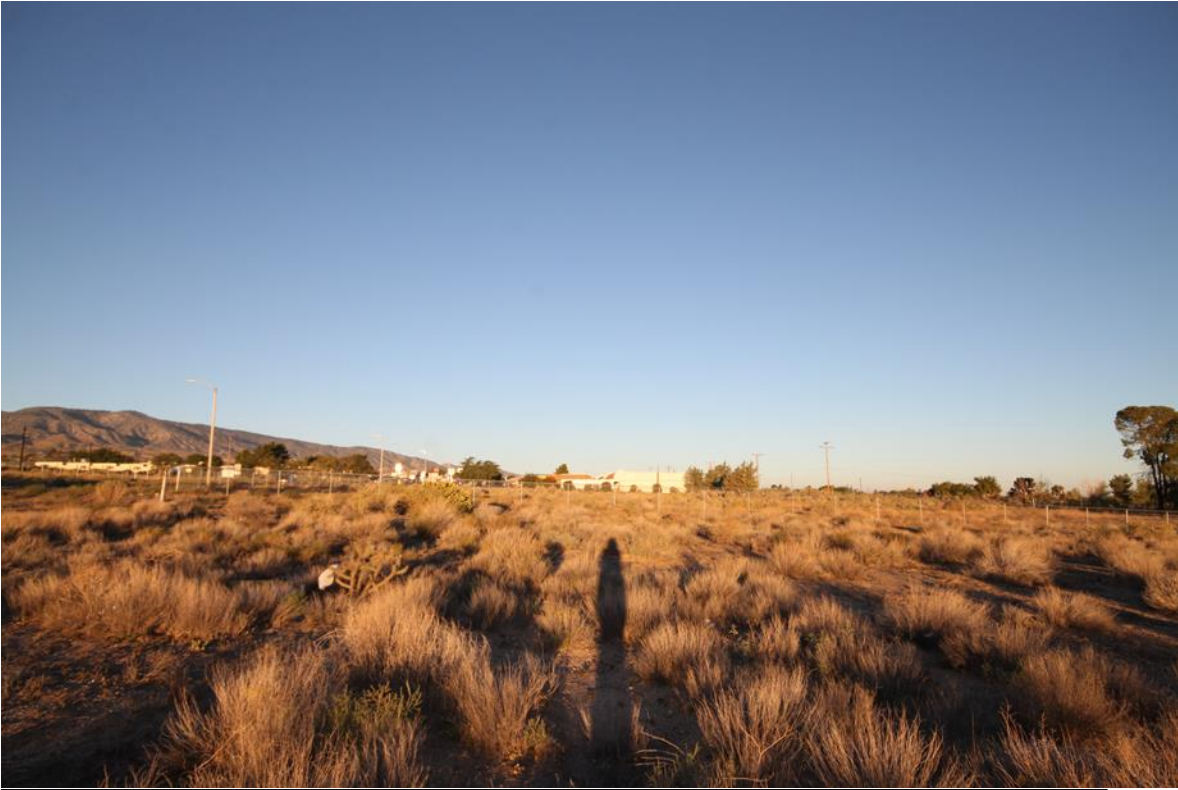
Looking west from the subject property.