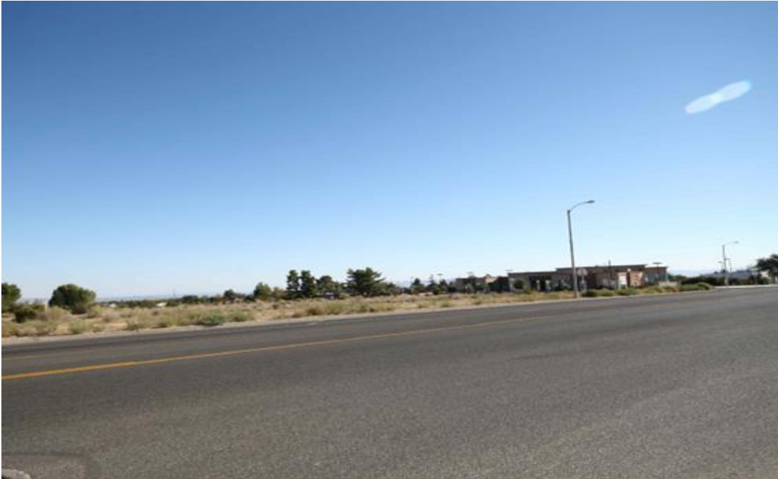
Looking at the project site, generally from a southwesterly direction from Phelan Road.