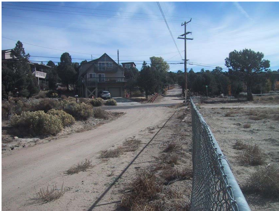
East facing view of the fiber trenching route