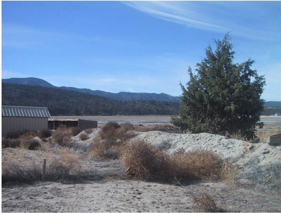
Southwest facing overview of the candidate location