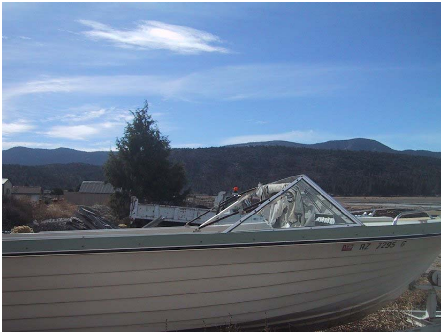
South facing view of the candidate location