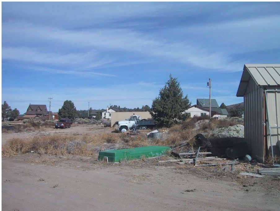
North facing view of the candidate location