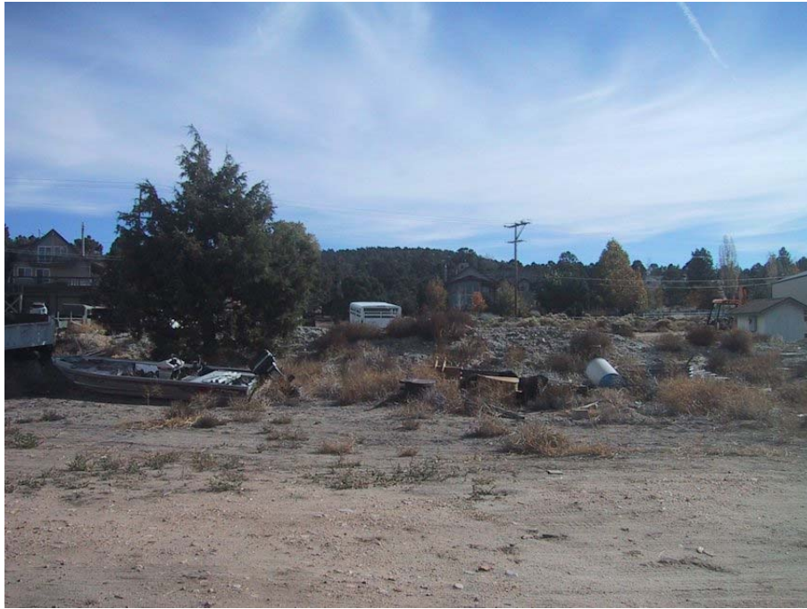
East facing view of the candidate location