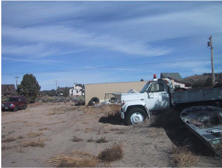
North facing view from the candidate location