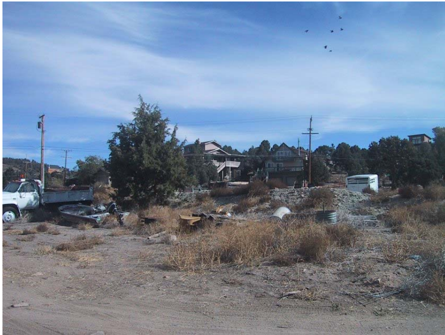
Northeast facing overview of the candidate location