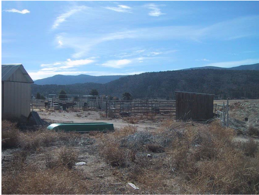
South facing view from the candidate location