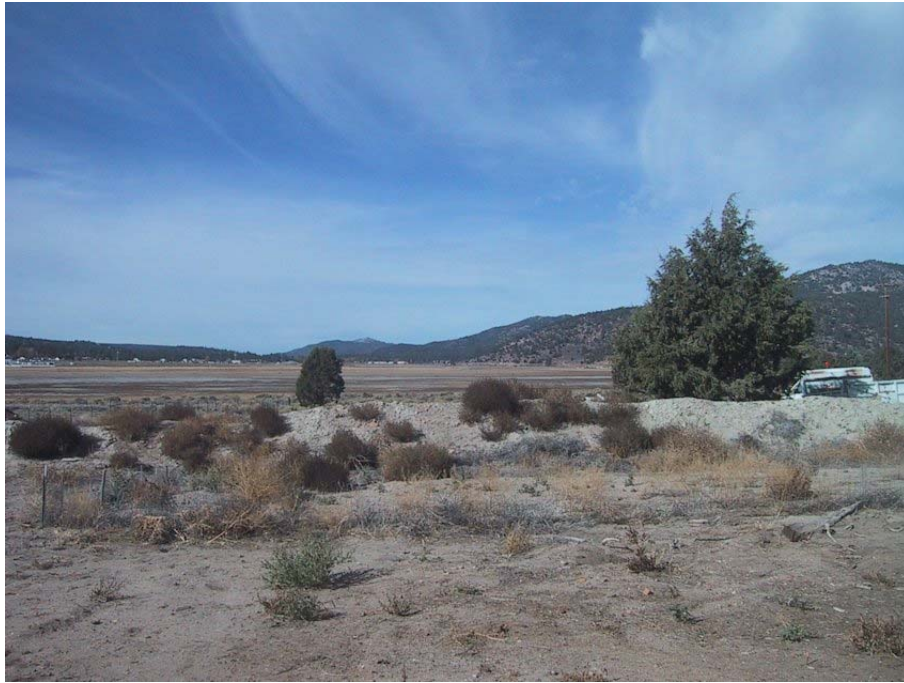
West facing view of the candidate location