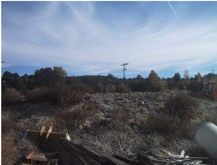
East facing view from the candidate location