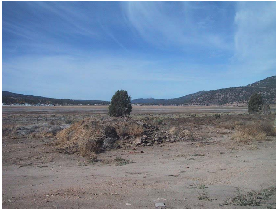
West facing view from the candidate location