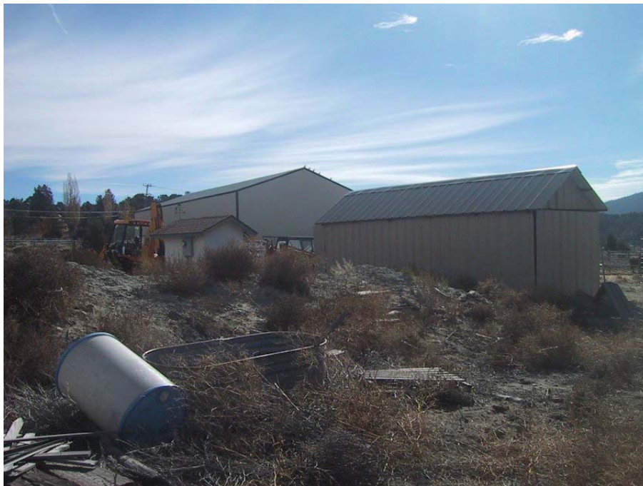
Southeast facing view from the candidate location