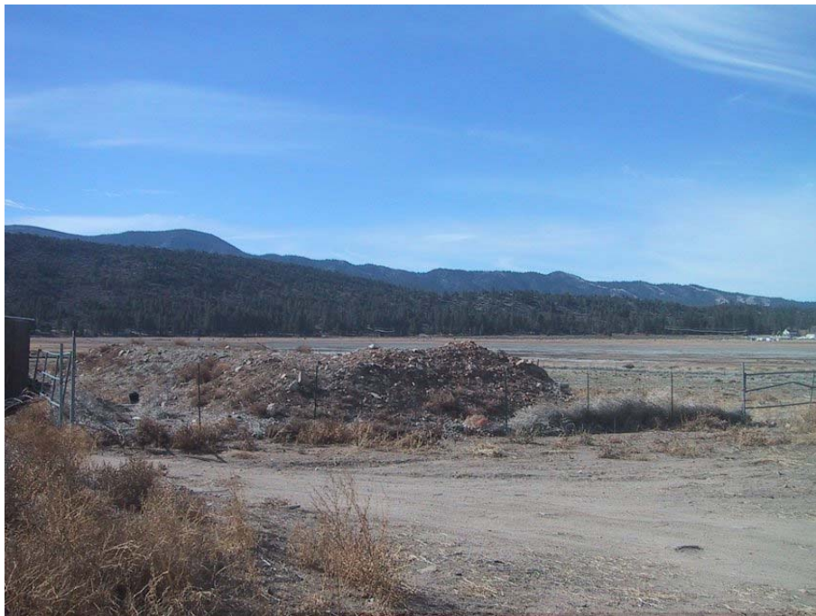
Southwest facing view from the candidate location