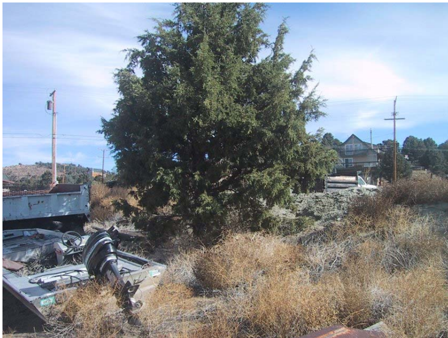
Northeast facing view from the candidate location