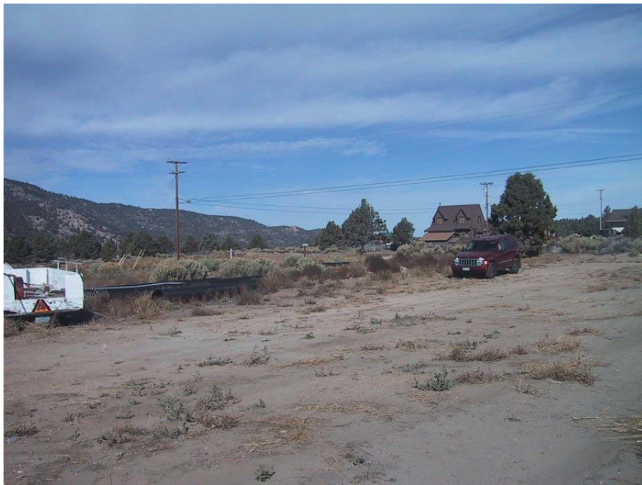
Northwest facing view from the candidate location