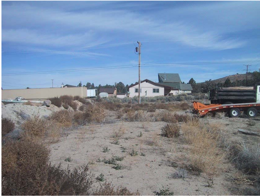
North facing view of the joint trenching route