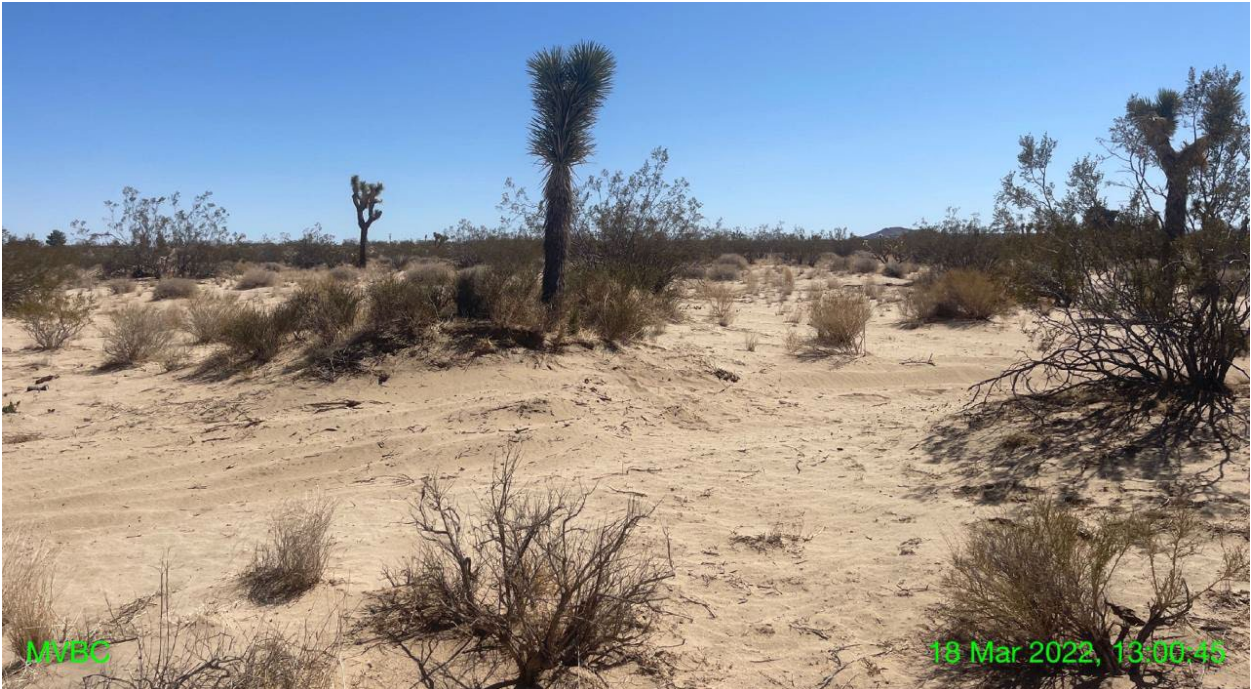
Figure 3 Project Site View Northwest corner of Subject Parcel looking southeast