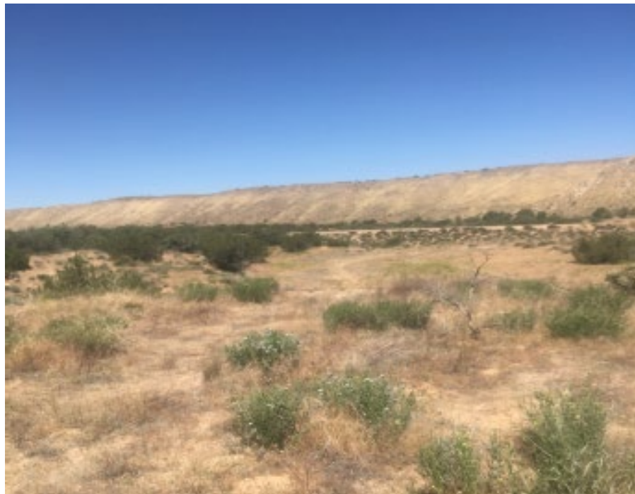
View from the Project site to the south towards Highway 173.