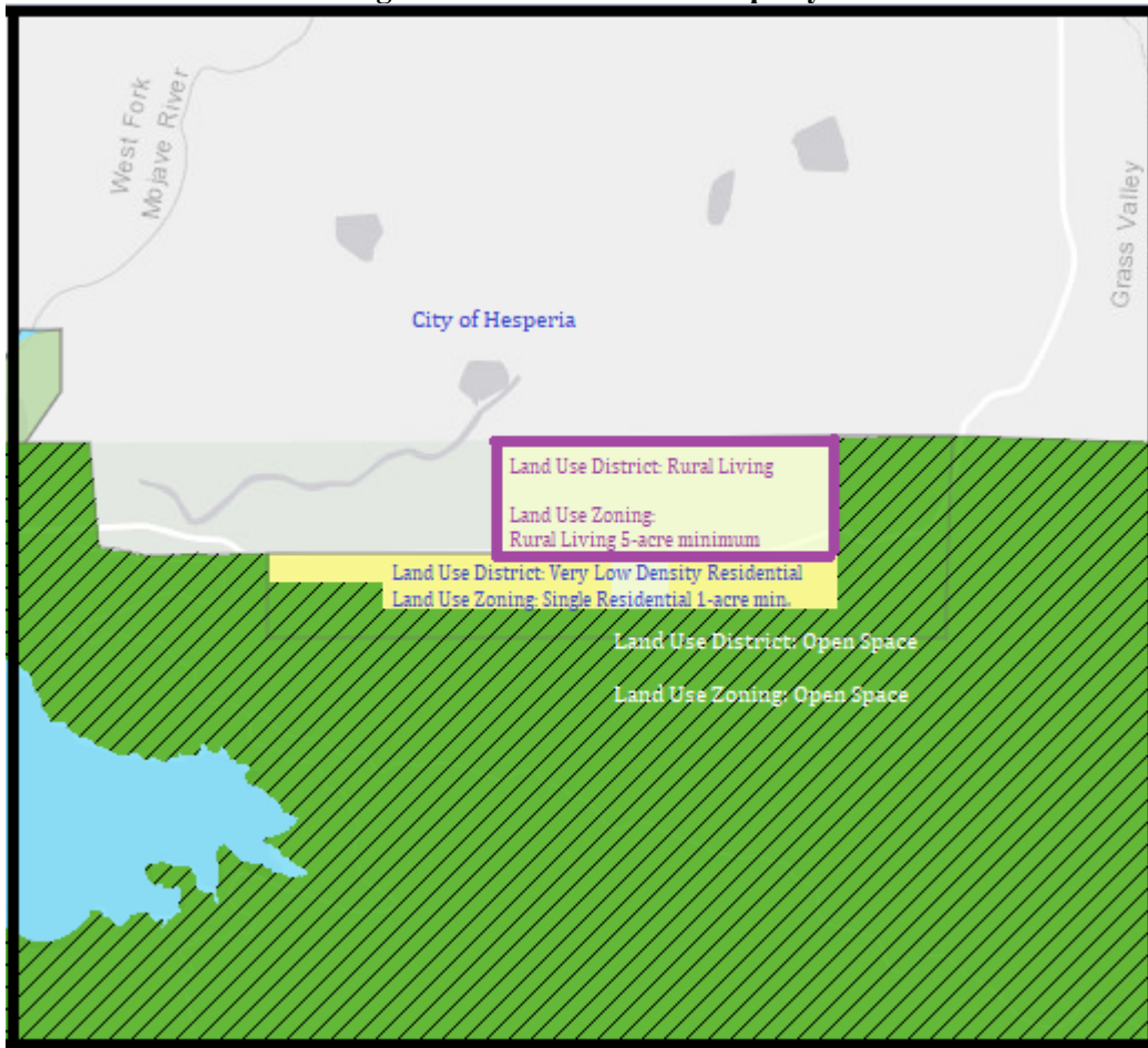
Figure 1 Land Use of the Property