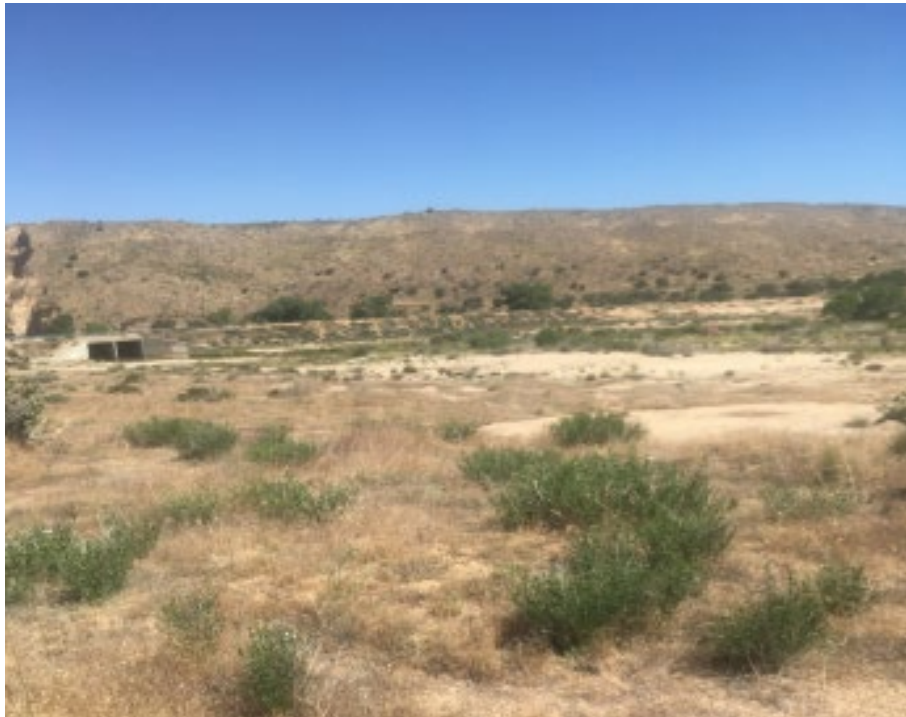
View from the Project site to the northwest. Mojave River Forks drainage in the upper portion of the photograph.