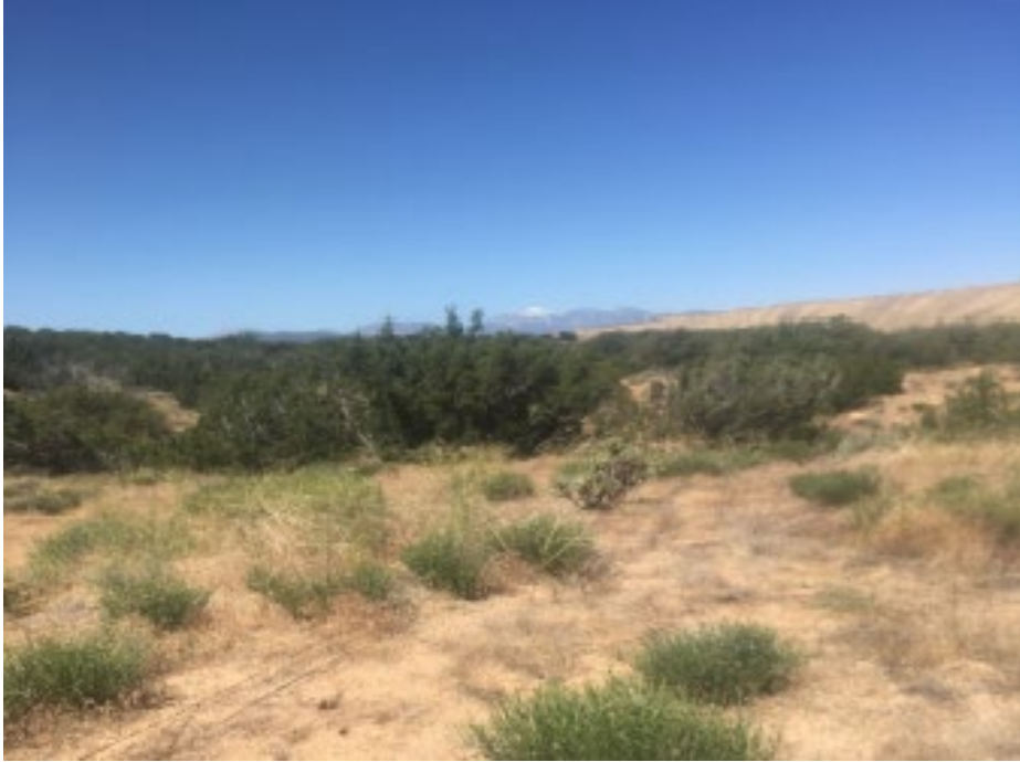
View from Project Site towards the southwest.