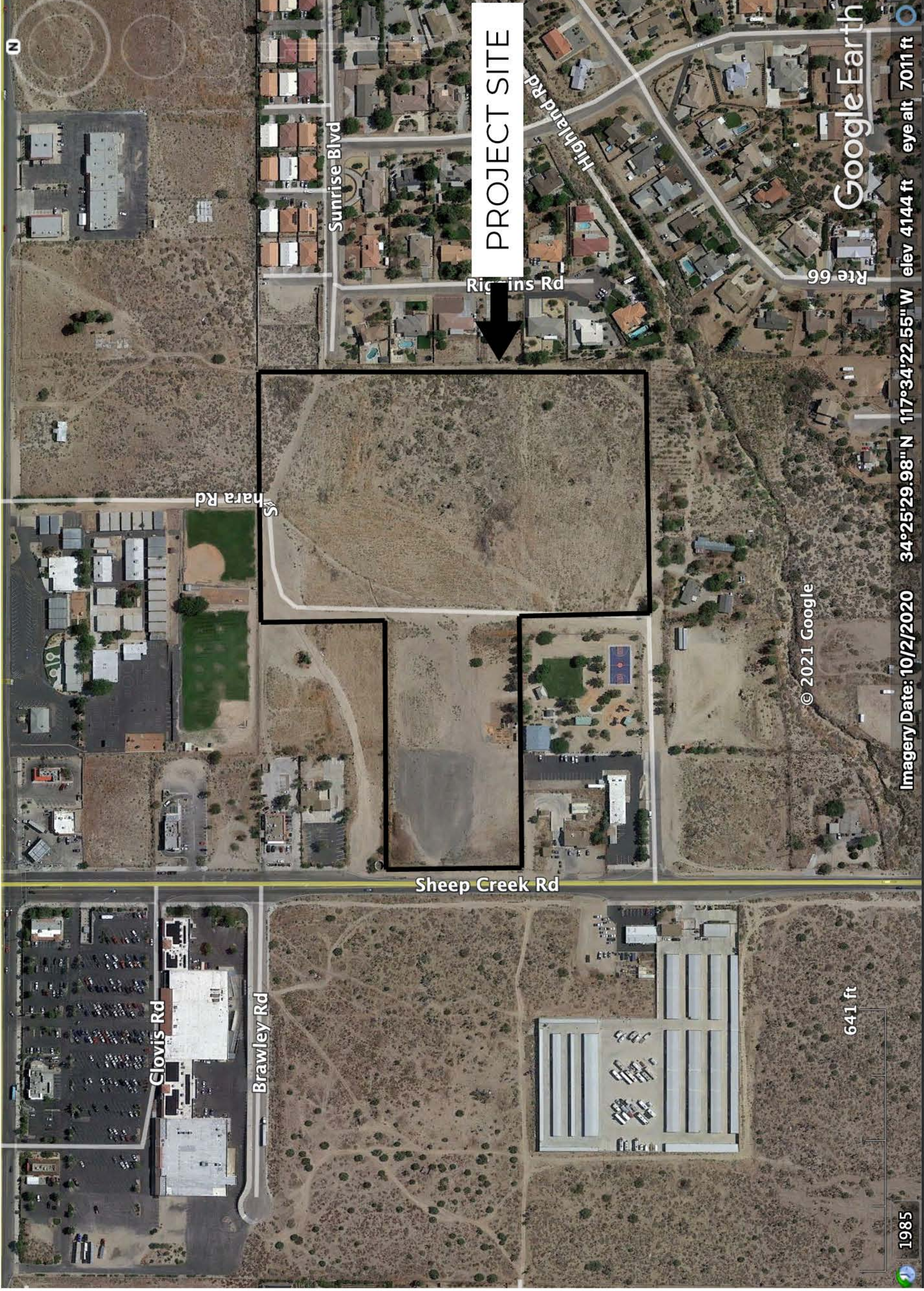
FIGURE 2: VICINITY EXHIBIT

RCA ASSOCIATES, INC.