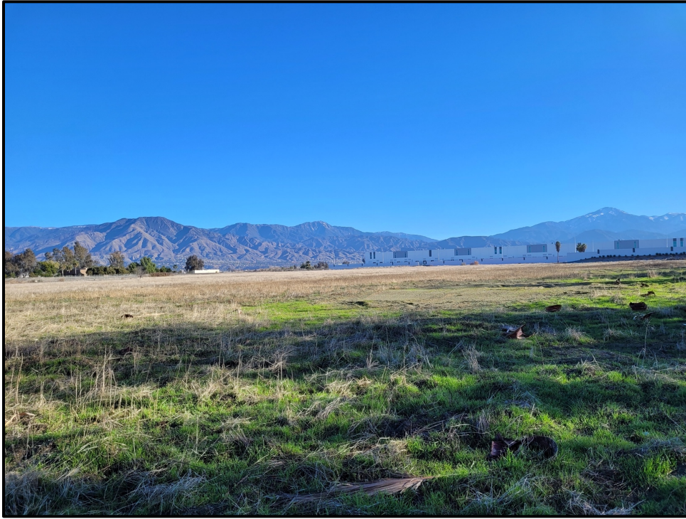
Plate 3.2-1: Overview of the project, facing northeast.