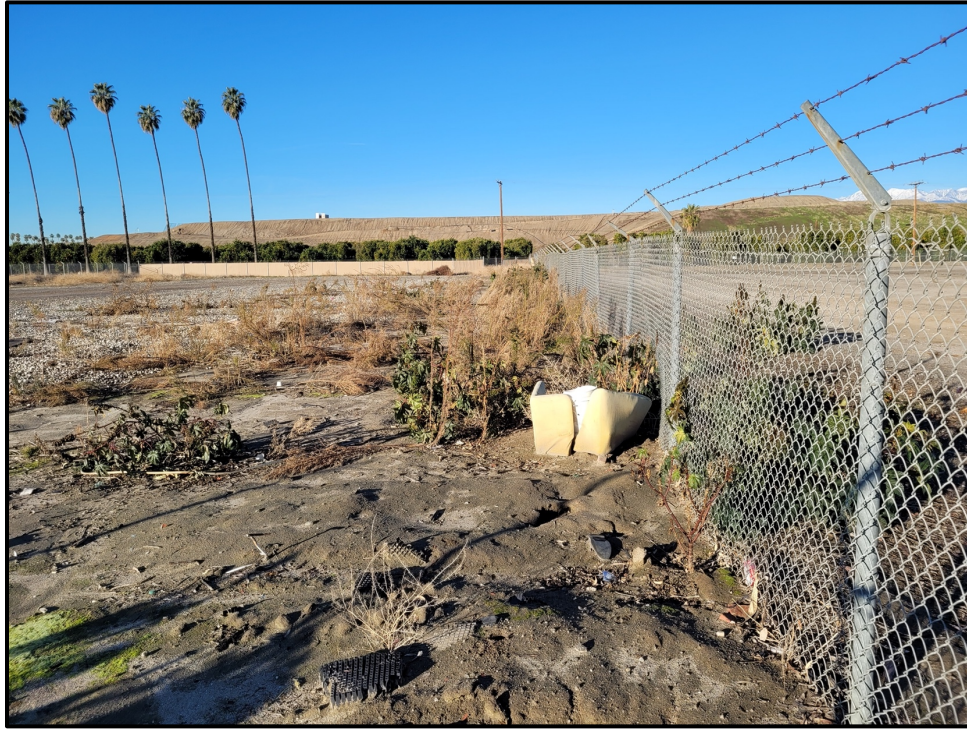
Plate 3.2-3: Overview of the fenced-in area, facing west.