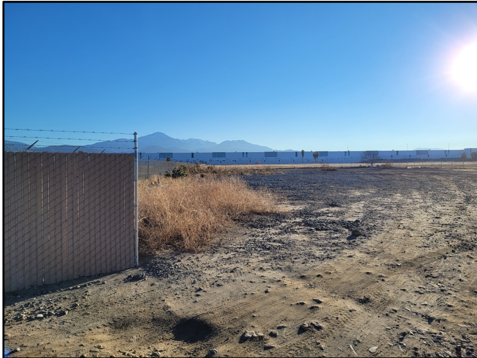
Plate 3.2-4: Overview of the fenced-in area, facing east.