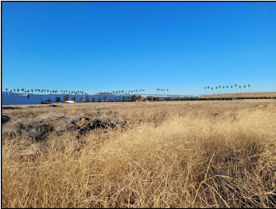
Plate 3.2-2: Overview of the project, facing southwest.