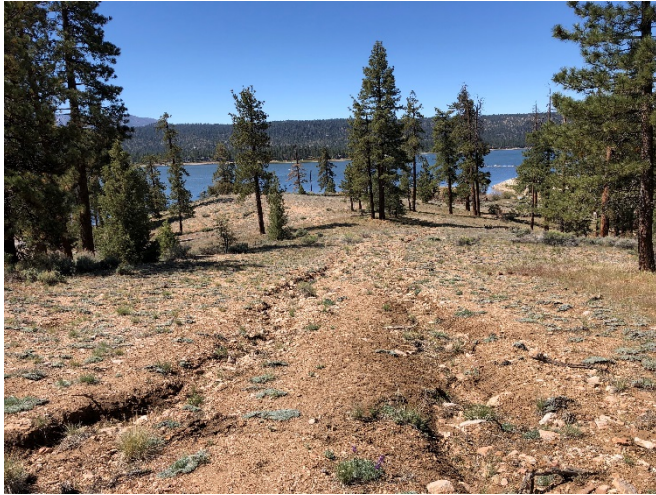
Non-jurisdictional Driveway Area Facing South