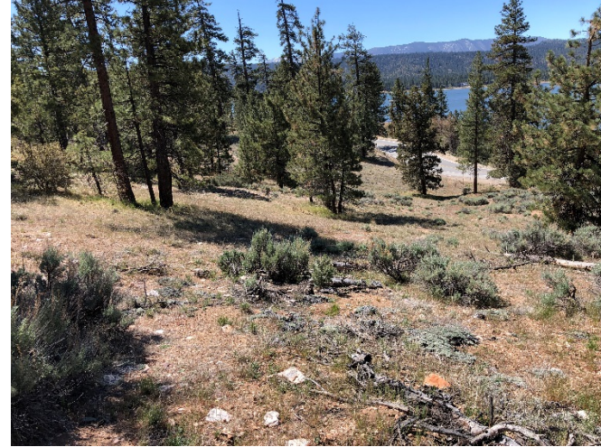
Downslope of Non-jurisdictional Driveway Area Facing Southwest