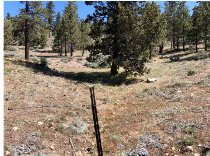
Drainage One Facing North