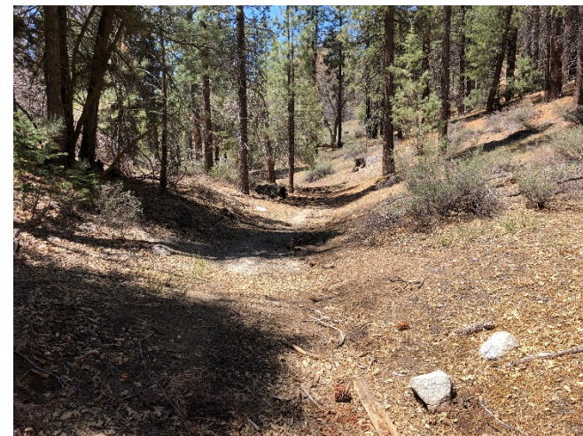
Drainage Three Facing South