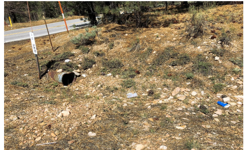
Drainage Two Facing Southwest