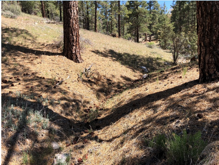
Drainage Two Facing South