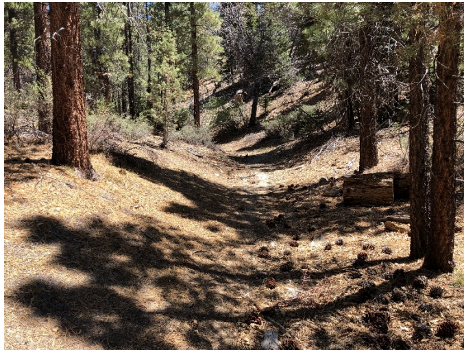
Drainage Three Facing North