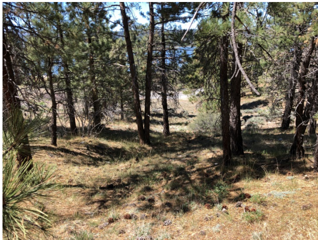
Drainage One Facing South