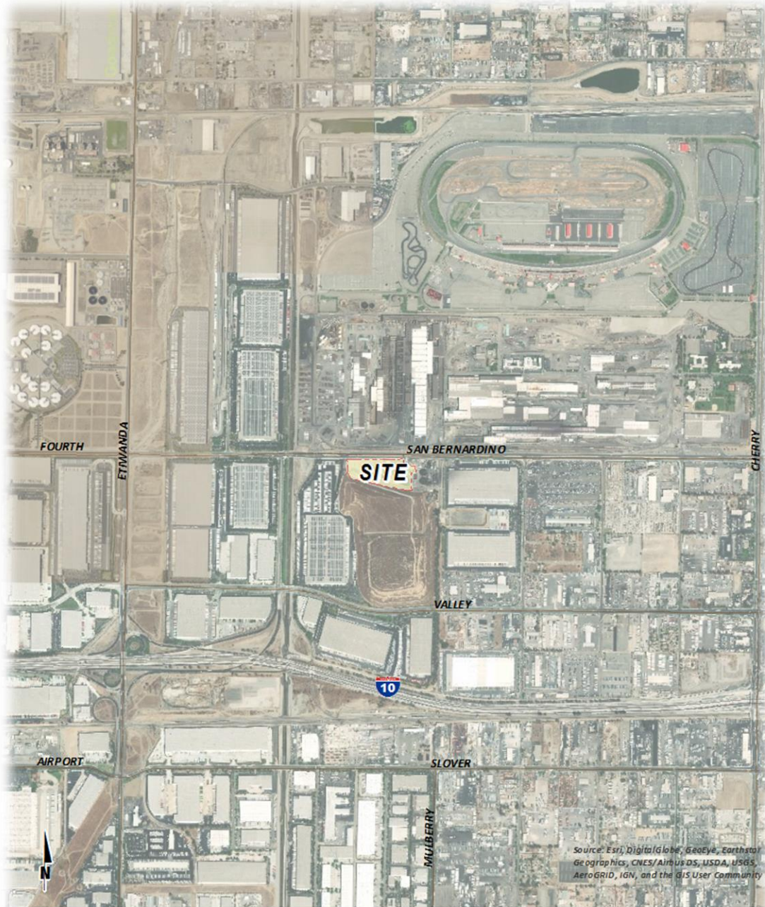
EXHIBIT 1-A: LOCATION MAP