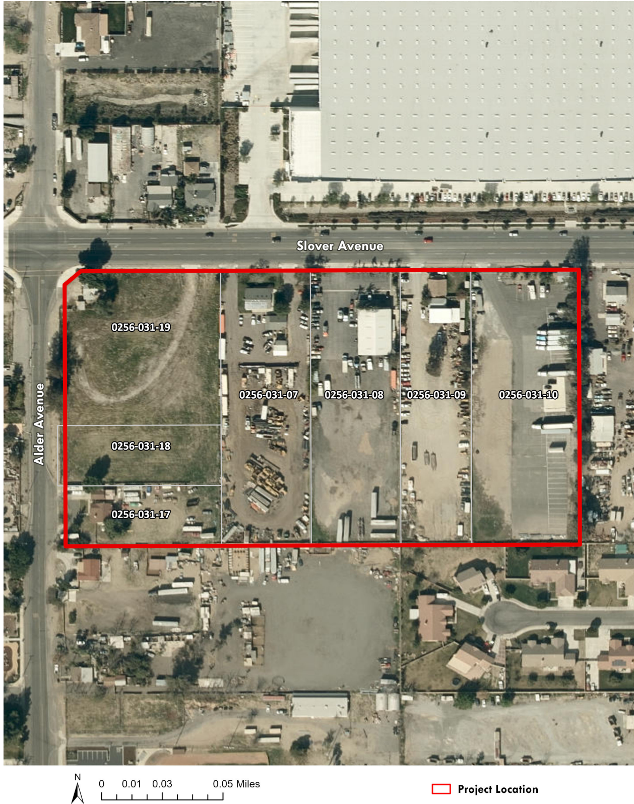
Duke Warehouse on Slover & Alder