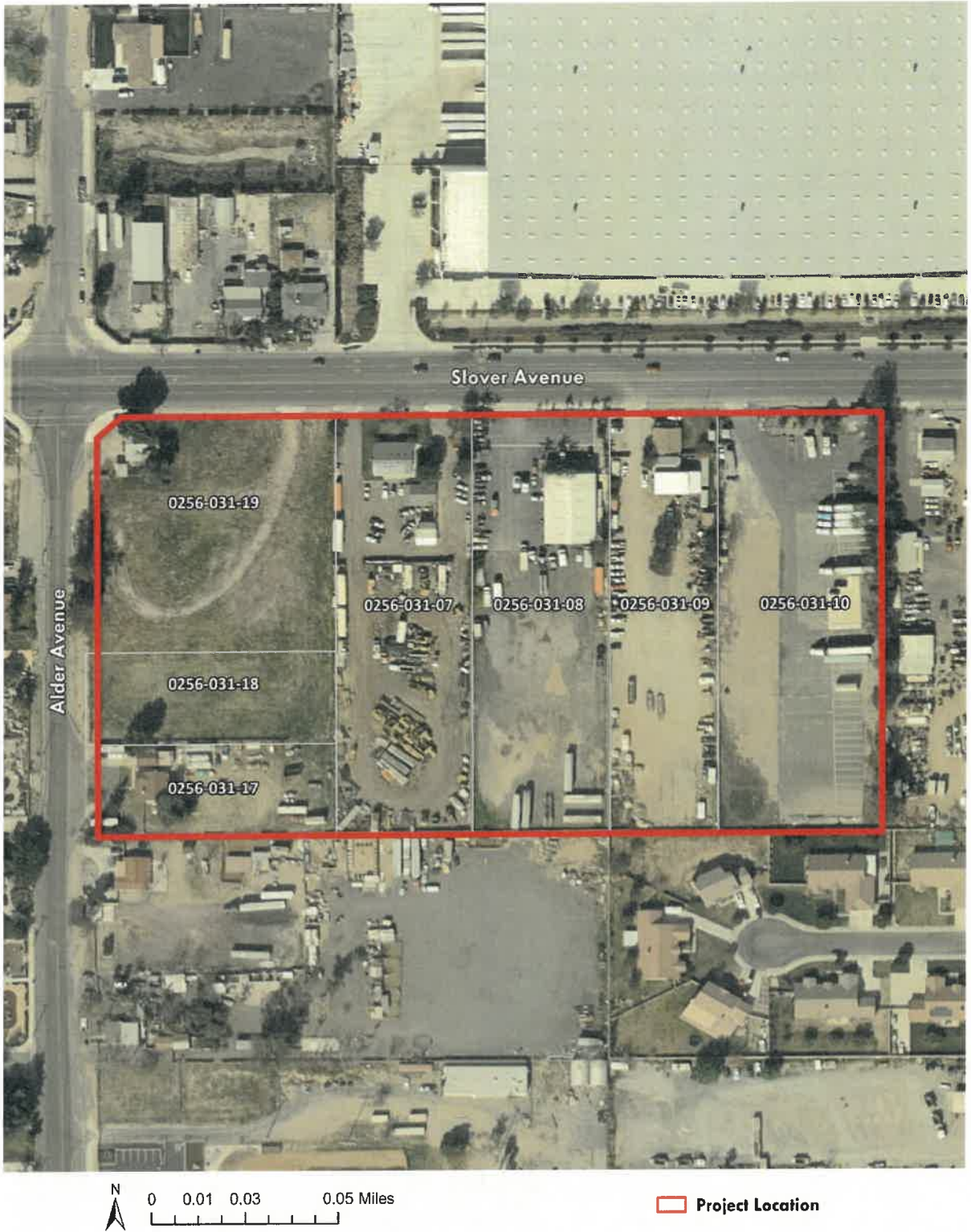
Duke Warehouse on Slover & Alder