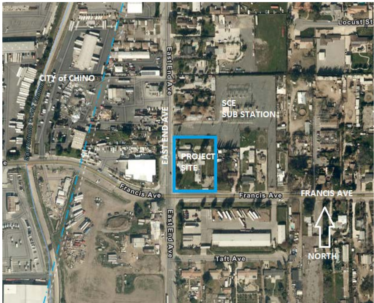
Figure 1 Project Aerial NE Corner of East End Avenue and Francis Avenue